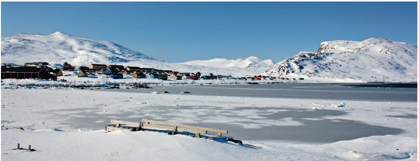
Nanortalik community adjacent to Nalunaq Goldmine operating from 2004-2013 in South Greenland