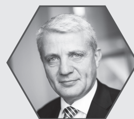
Secretary General Dagfinn Høybråten Nordic Council of Ministers

This is far more than just recycling and it is a far cry from merely burning waste to generate heat or energy. We need these kinds of activities too, but in a world with scarcer resources we need to plan very carefully for how we use what we have."