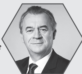
Minister Sven-Erik Bucht, Ministry of Enterprise and Innovation of Sweden

"The development of a bioeconomy requires new competences and cooperations. In the Nordic region we don't have to look far for such fruitful cooperation. We have great potential for the transition into a bioeconomy with plenty of biomass supply. Through Nordic cooperation we can become a stronger voice within the EU and make the most of our potentials."