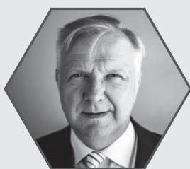
Minister Olli Rehn, Ministry of Economic Affairs and Employment of Finland

"Nordic countries and regions can lead the way in the bioeconomy and inspire countries in the EU and around the globe. We have the natural conditions, the industrial infrastructure and the skills to strengthen our competitiveness and create more jobs, while combating climate change."